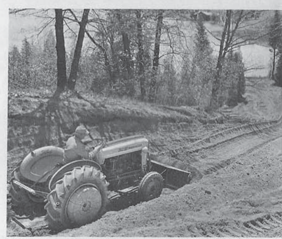
Blade work —Both front and rear blades are available for grading, leveling and backfilling . . . easy maintenance of paths and roads in recreation areas.