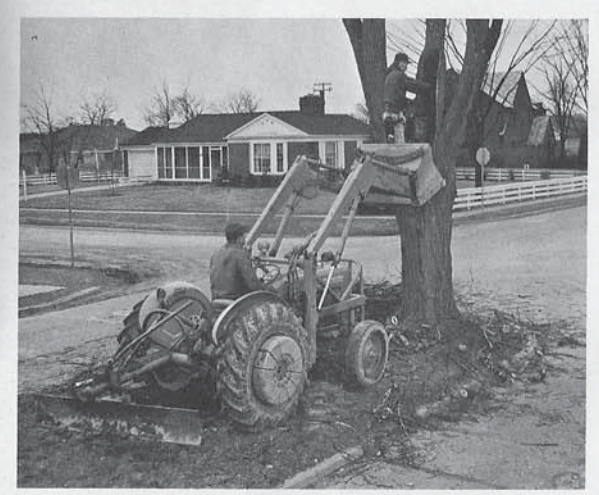
Tree repair —For raising, pruning, cavity filling, many other types of tree maintenance. Ford also helps remove dead trees, stumps and storm litter.