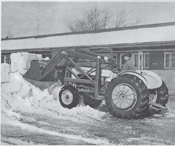
Snow removal —Ski clubs, winter resorts, motels, many other areas benefit by quick handling of snow problems. And Ford loaders range up to 2500 lb. capacity!