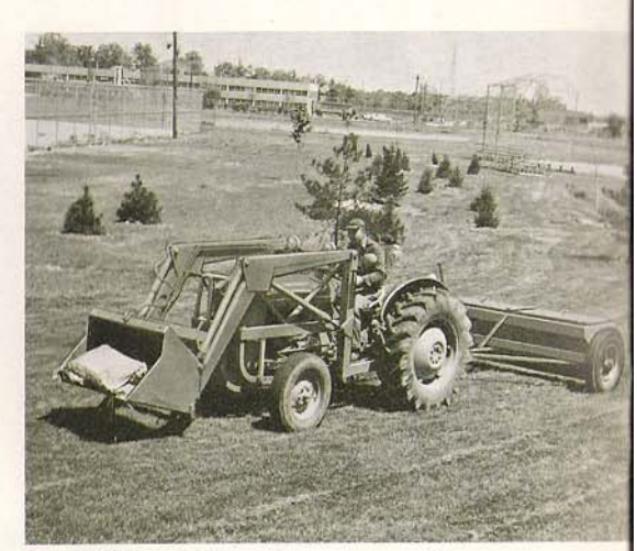
Fertilizing—Just one operation among dozens handled by Ford in land reclamation, seedbed preparation, turf building and year-round turf maintenance.