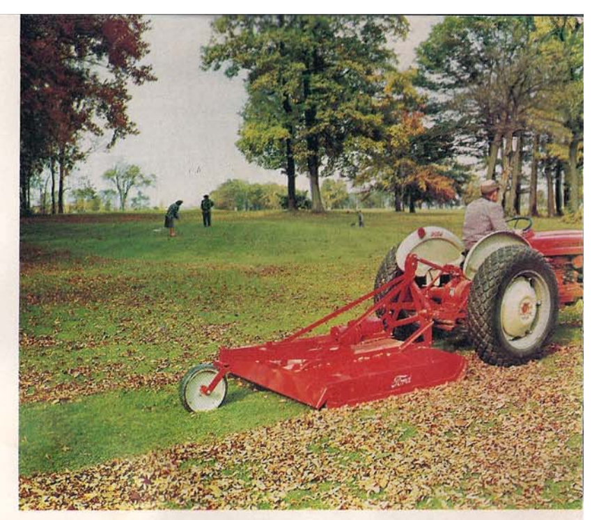
Leaf mulching —Pulverizing and mulching with rotary cutter is a quick convenient way to dispose of leaves and at the same time return valuable organic matter and plant food to soil. Fall and spring fertilizing and spring aeration will speed up decomposition.

Windrow deflector —Scatters clippings uniformly, helps prevent windrowing of heavy materials.