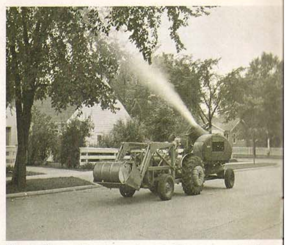
Spraying —For insect and disease control on trees and shrubs; weed control; chemical treatment and artificial coloring of greens and fairways.

Clean sweep. Ford tractors can be equipped with front or rearmounted brooms for quick, low-cost sweeping of walks, streets and parking areas in factories, shopping centers, etc. The same unit is an excellent "pressure partner" in winter. It clears snow in depth to 6" or cleans up following snow plows.