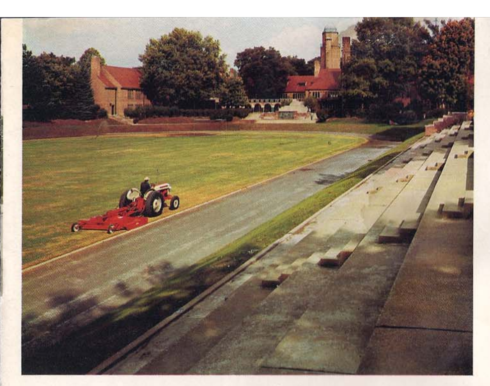
Fast, big expanse mowing (2"-4")—You mow up to a full acre for every mile per hour of ground speed with Ford Powermaster tractors and Ford's big 100" rotary cutter. And as with other models, you'll appreciate the way it skims through grass up to 15" high during wet, busy periods.