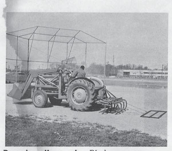
Dressing diamonds —Blades, scrapers and cultivators are just a few of many Ford attachments adaptable for quick, low cost maintenance of ball diamonds.