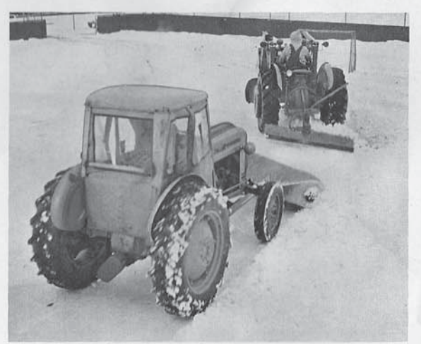
lce rinks—Blade and broom make an efficient tandem team for quick clean-up between skating sessions. Tractor-loader also dumps excess snow, tows planer.