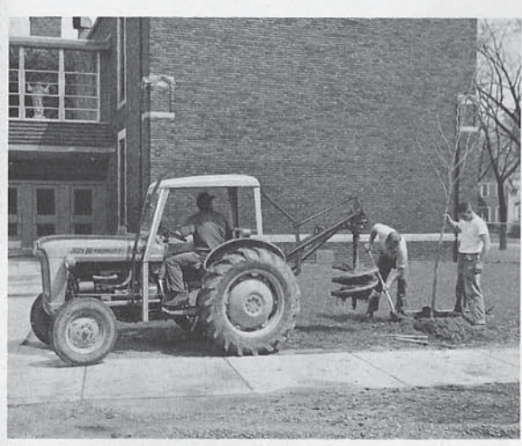
Landscaping—A posthole digger saves many hours with trees and shrubs—both at the nursery and on landscape projects. Helps, too, with signs, swing sets, etc.